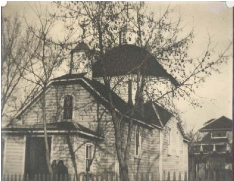
First church— 1st Street & Lorne Avenue