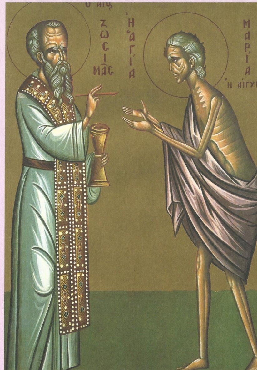
Icon of Saint Mary and Saint Zosimos