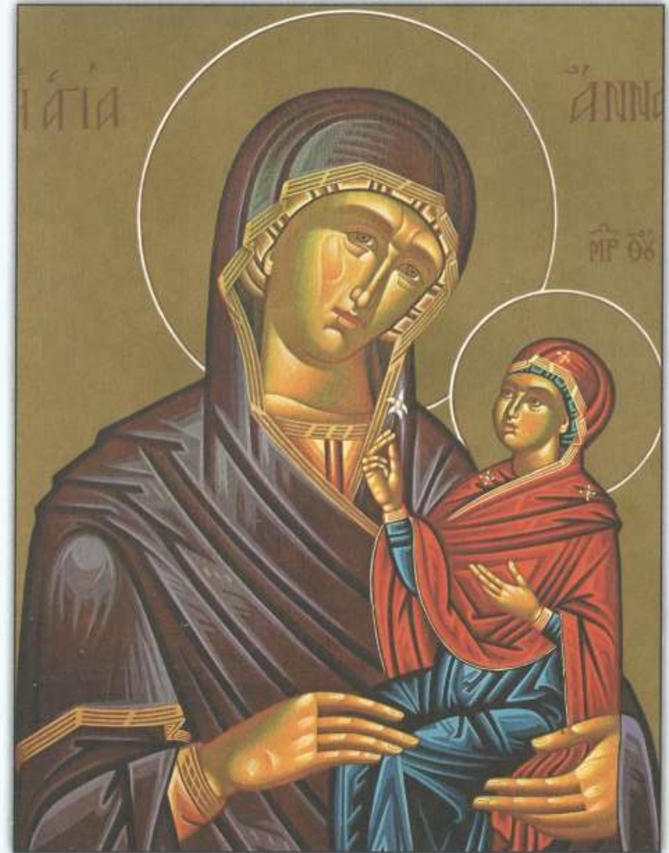
Icon of Saint Ann and Mary -- December 8-9