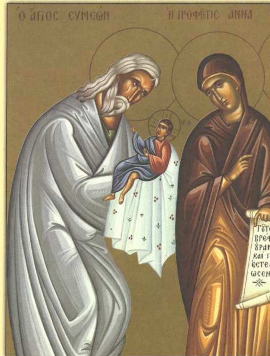
Icon of Saints Simeon and Anna -- February 3rd