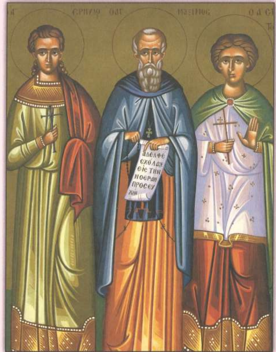
Icon of Saints Hermylaus, Maximus and Stratonicus -- January 13 th