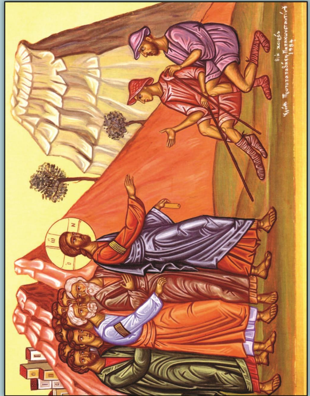
Icon of Healing Two Blind Men