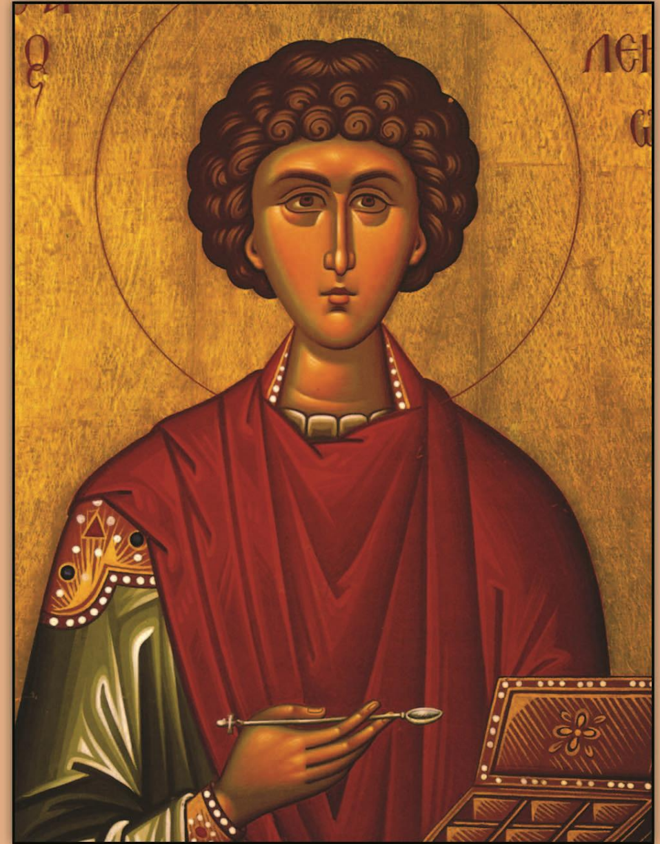
Icon of Saint Panteleimon -- July 27 th