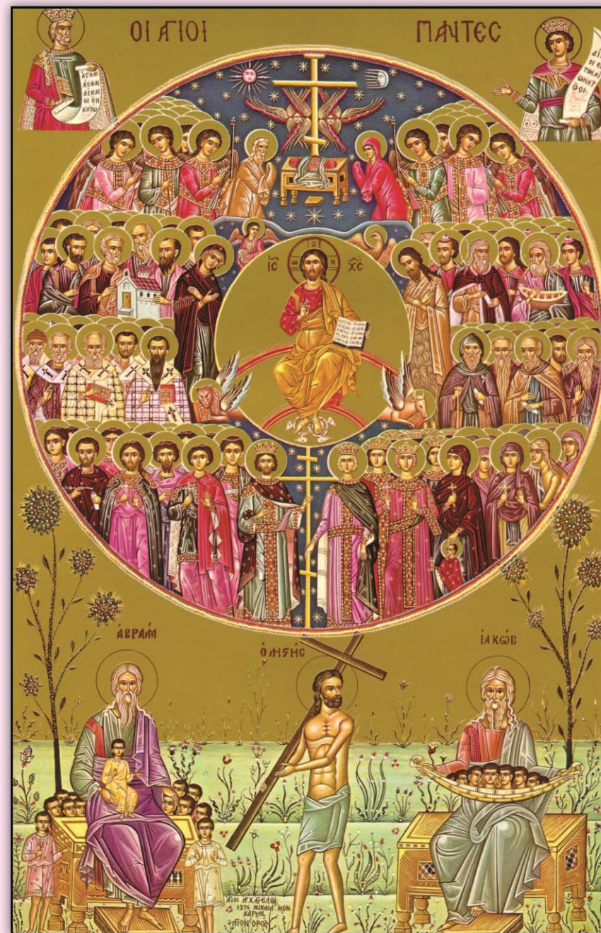
Icon of All Saints