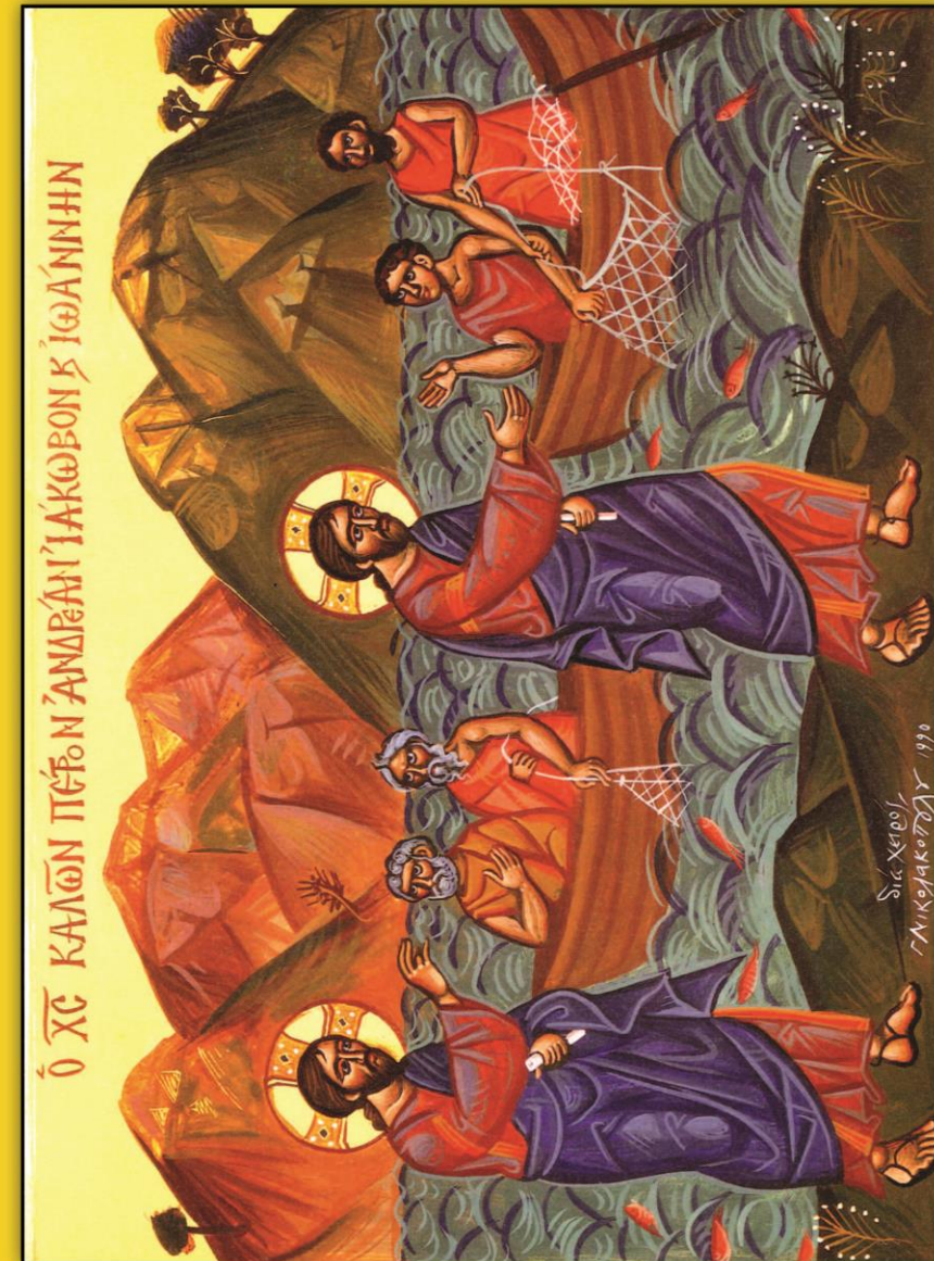
Icon of the Call of the First Apostles