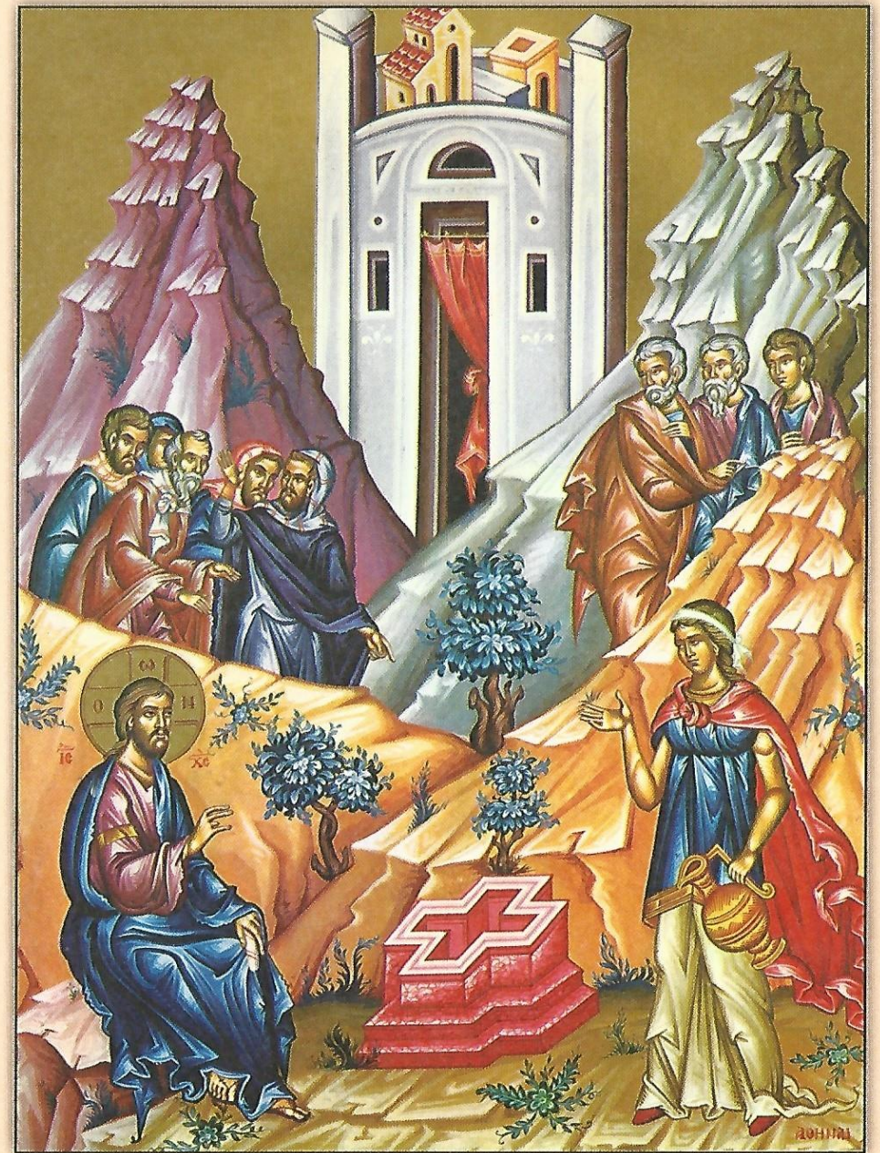
Icon of Our Lord with the Samaritan Woman