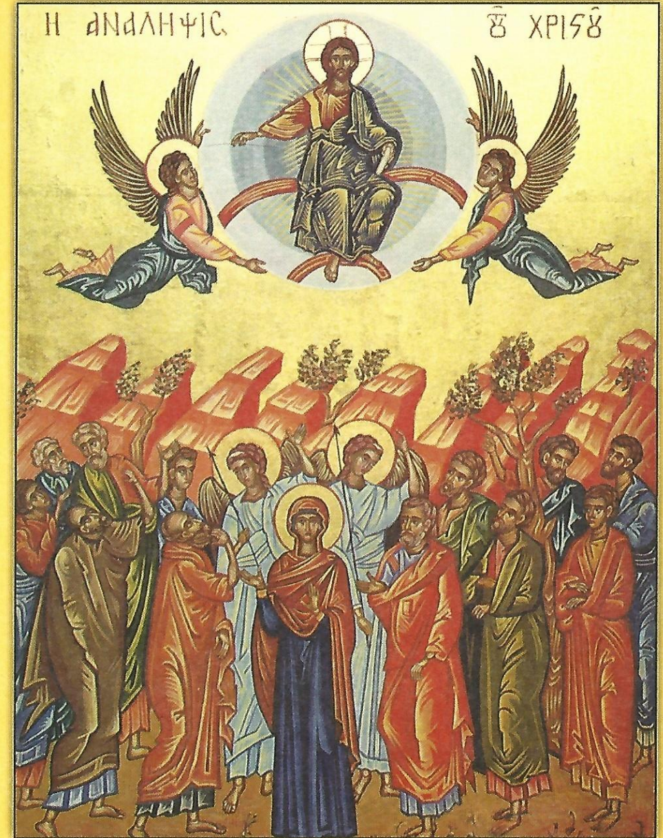
Icon of the Ascension of Our Lord -- May 21st