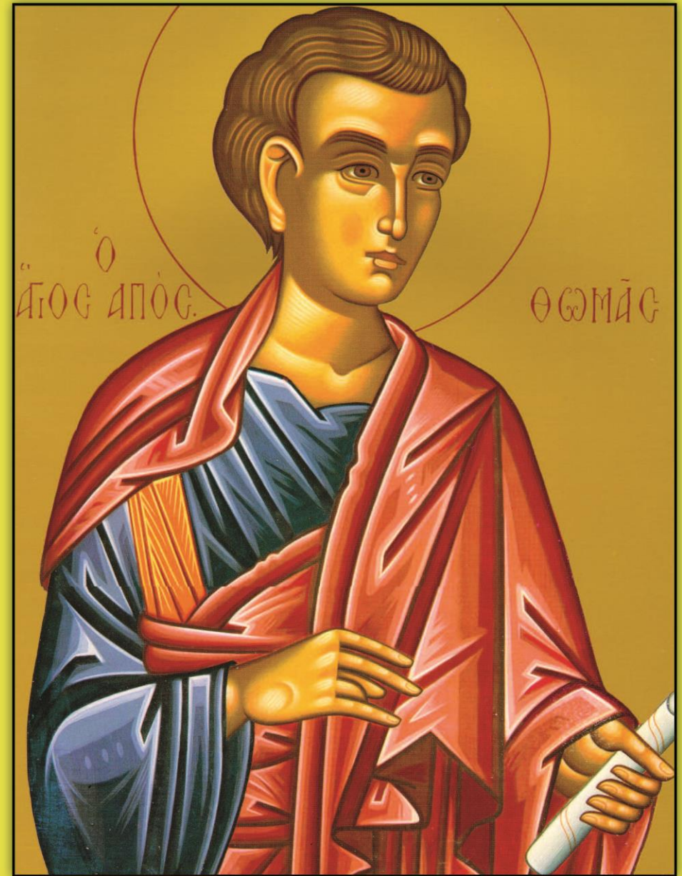
Icon of Saint Thomas -- October 6th