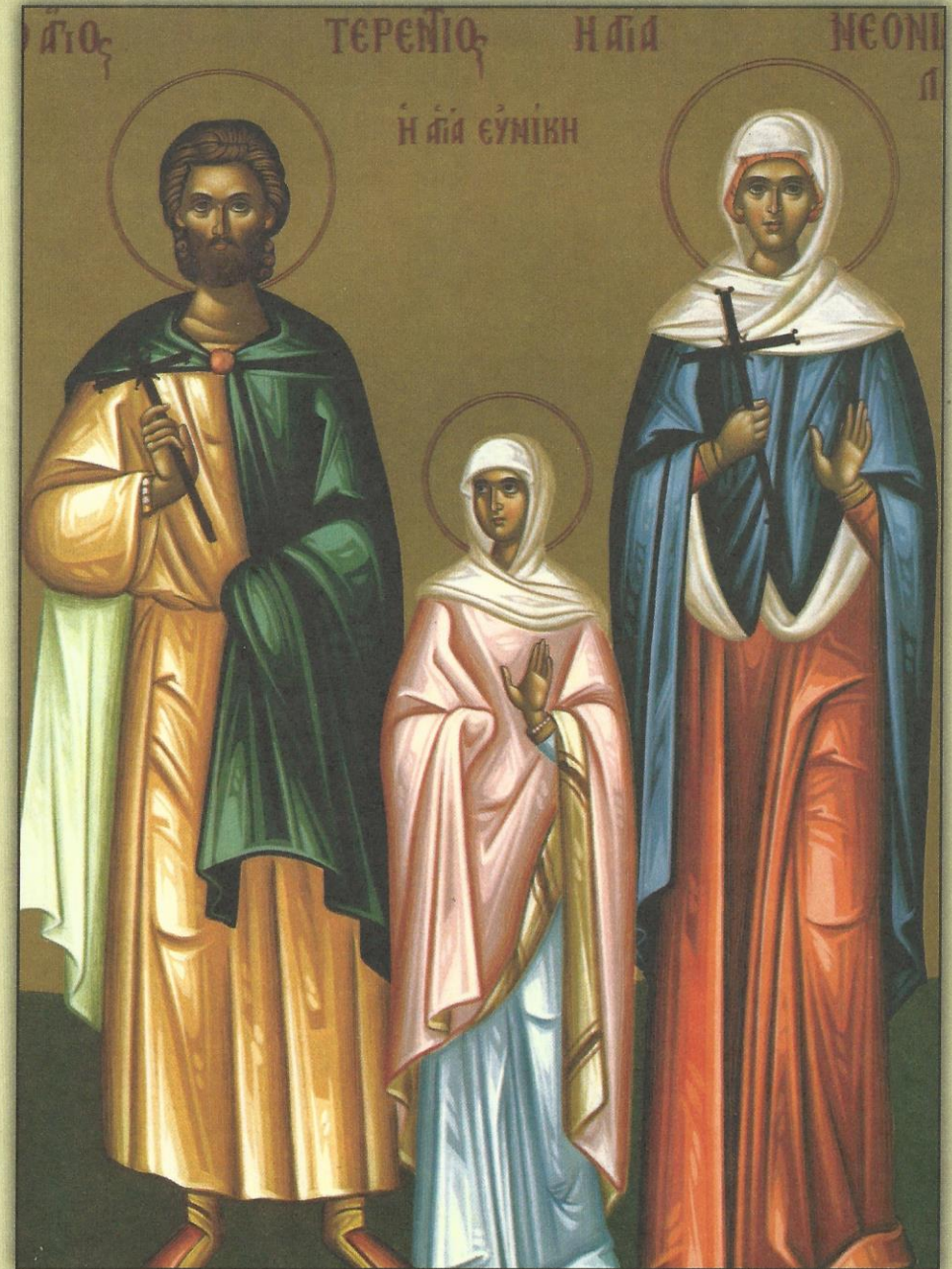
Icon of Saints Terrence and Eunice -- October 28th